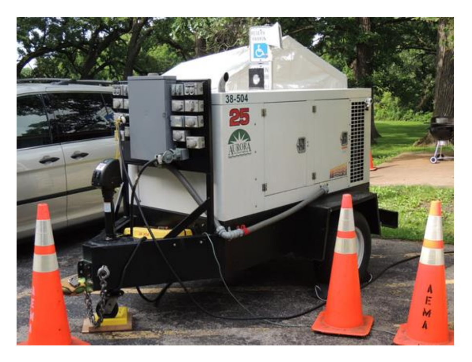
The City of Aurora provided two generators which gave us ample power to run all of the stations including some of the stations that had air conditioning which included the City of West Chicago's Mobil Emergency Operations Center. Great for such hot days!!