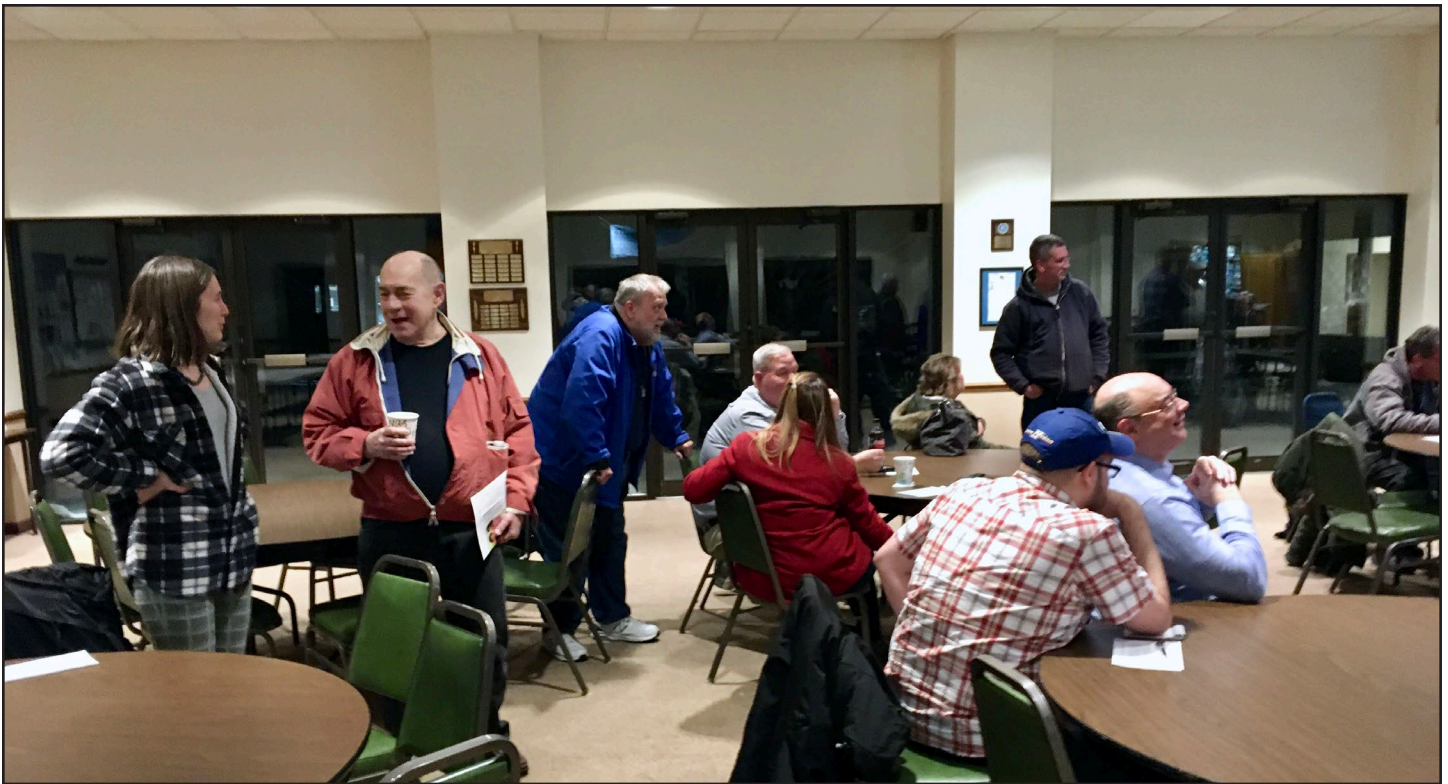
Come join the camaraderie at one of our monthly meetings! The social hour following the business portion is a great opportunity to meet your fellow hams.