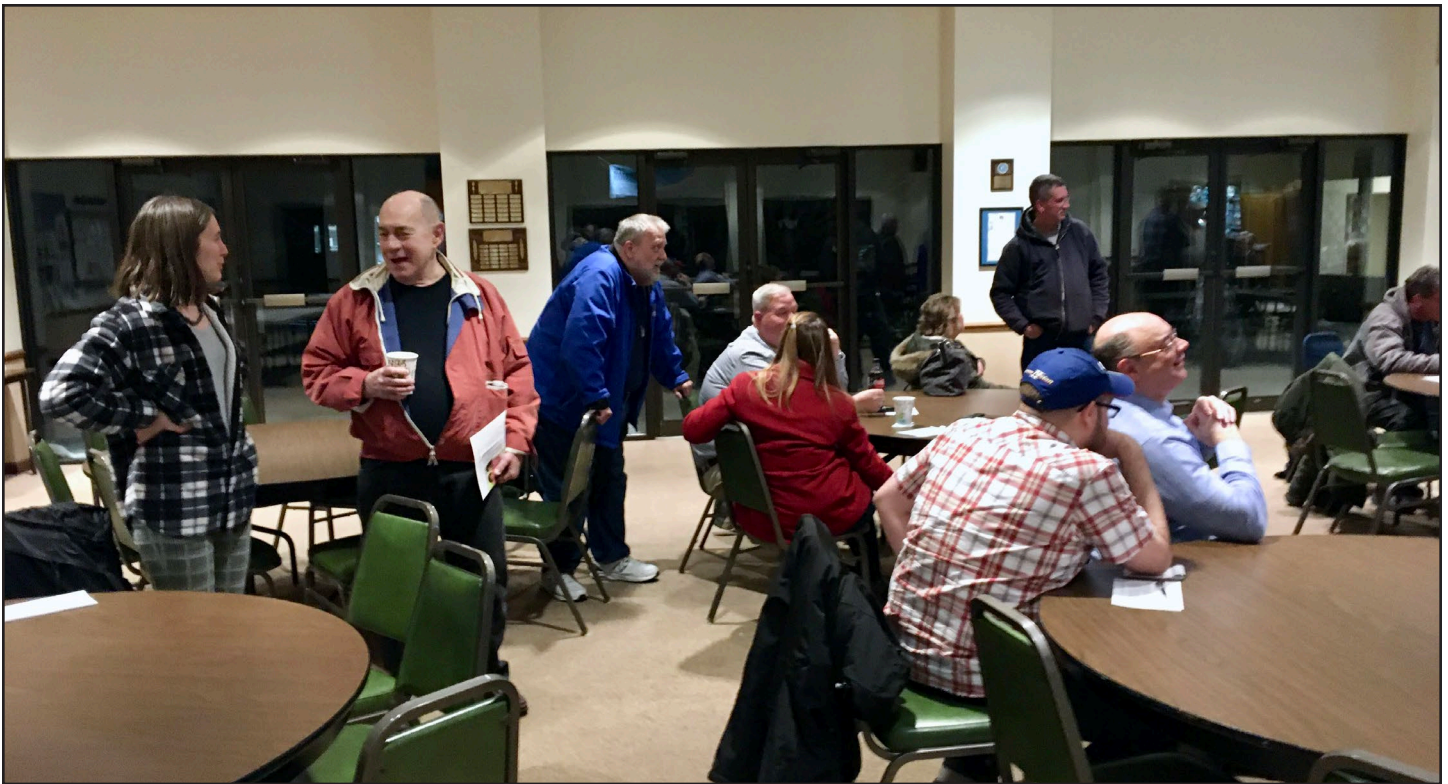
Come join the camaraderie at one of our monthly meetings! The social hour following the business portion is a great opportunity to meet your fellow hams.