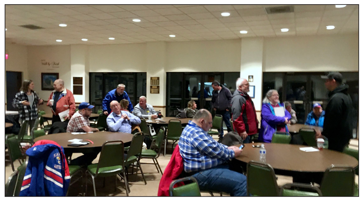
Come join the camaraderie at one of our monthly meetings! The social hour following the business portion is a great opportunity to meet your fellow hams.