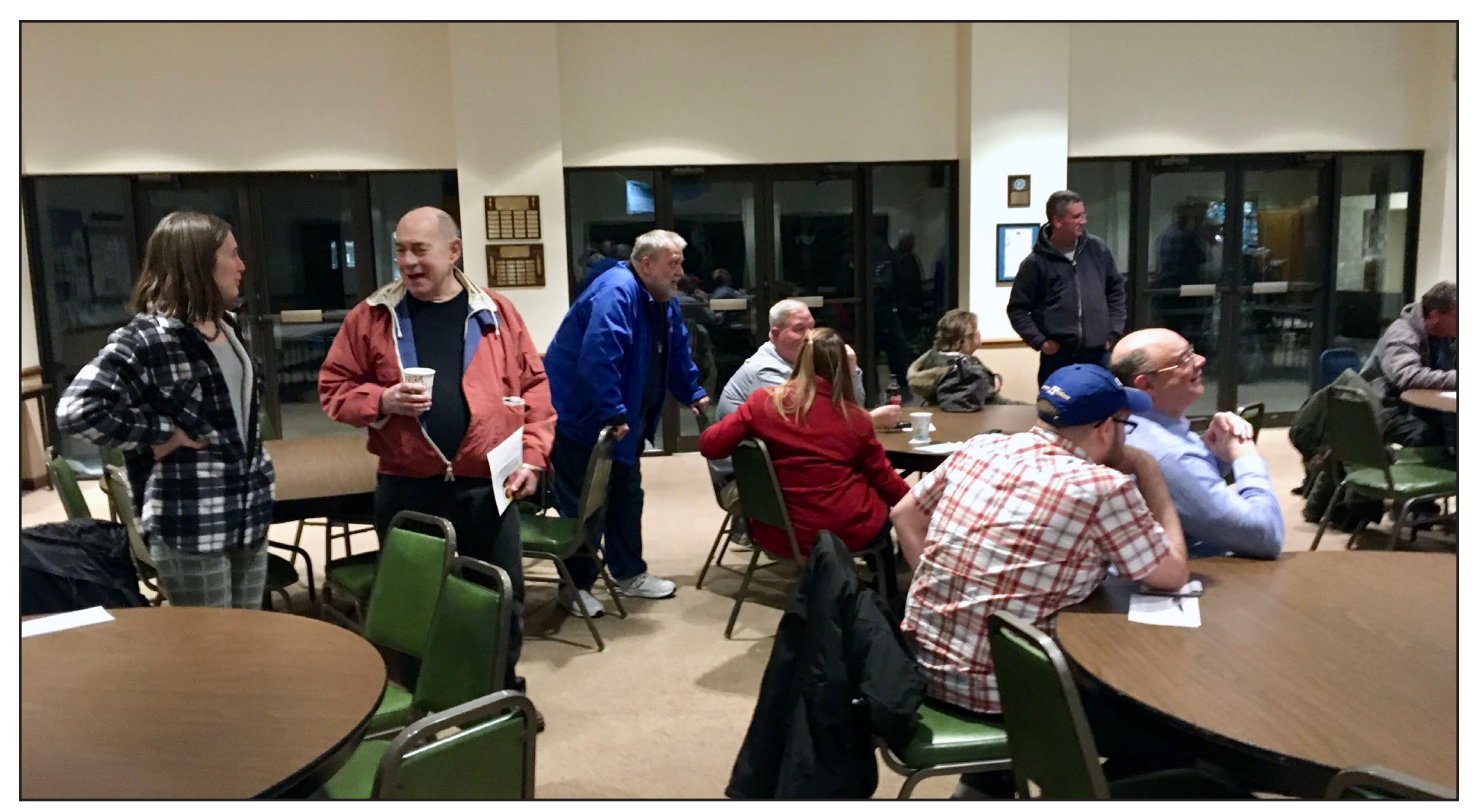
Come join the camaraderie at one of our monthly meetings! The social hour following the business portion is a great opportunity to meet your fellow hams.

as to how many VE's were in attendance. He asked that all VE's send him an email at president@frrl.org. He would like to develop a list.