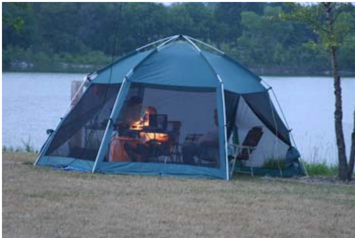
W9CZA spent a restful evening working PSK31 on the shores of Jericho Lake.