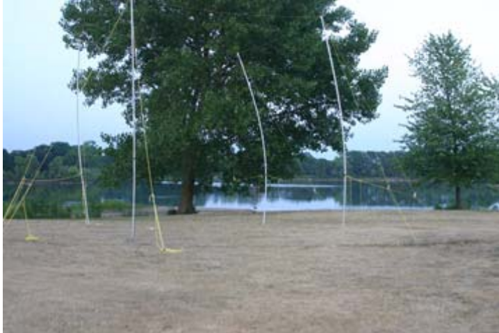
The 20 Meter "Loop by the Lake".