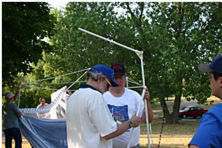
AH6EZ & N9CHA try to solve the great tent-pole puzzle.