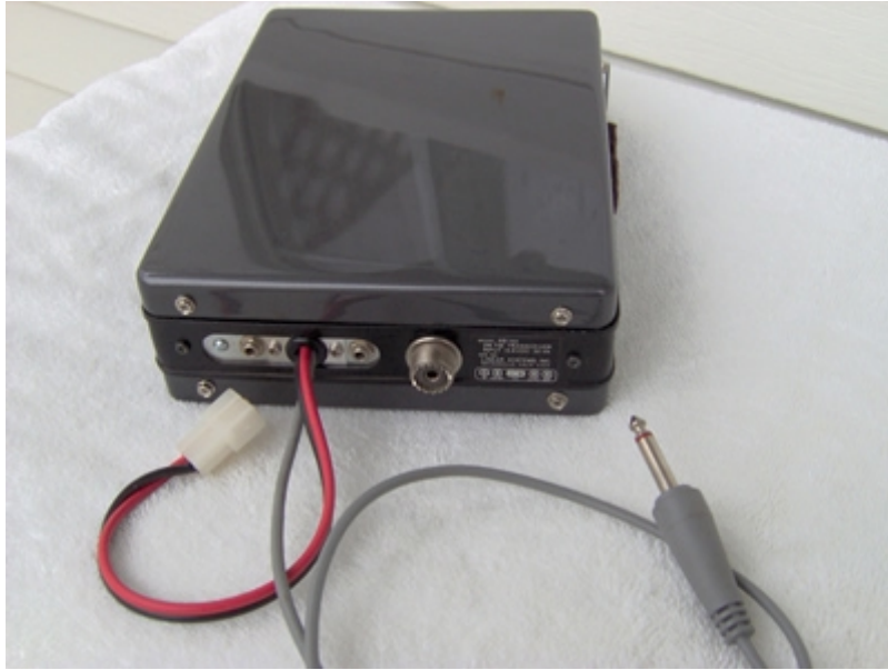
Fig 1. The replaced the broken power receptacle, showing the new metal plate and rubber grommet .