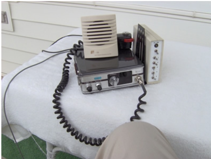
Fig 2. The complete SBE model SB144, outboard PL assembly, speaker and microphone. Everything old IS new again!