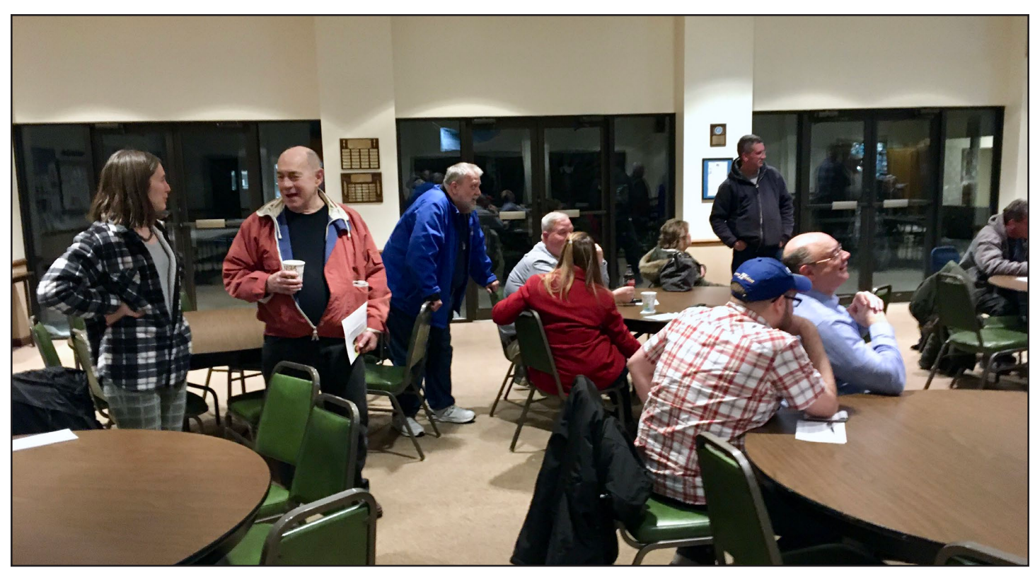
Come join the camaraderie at one of our monthly meetings! The social hour following the business portion is a great opportunity to meet your fellow hams.