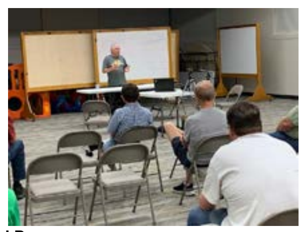
K9FE Talks About Field Day