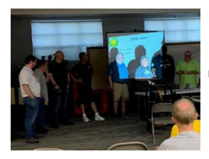
Meet The Field Day Band Captains